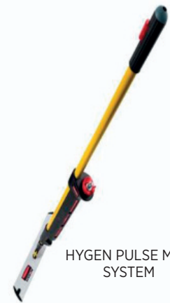
HYGEN PULSE MOP SYSTEM

Soluble dirt should be removed by cleaning using a spray-buff system – the best on the market being the Hygen Pulse Mop System (Order ref: 950104) – a sturdy mop which features an on-board reservoir and user-controlled release of solution. The removable cleaning heads (which are machine-washable) should be replaced periodically to ensure effective maintenance.