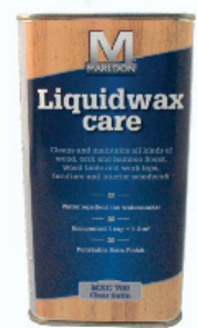
MARLDON MXC700 LIQUIDWAX CARE