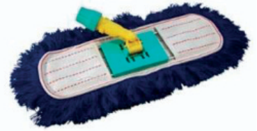
40CM DUST BEATER MOP

Floors should be cleaned daily using dry cleaning methods, such as vacuum or dust control mop, such as the 40cm Dust Beater Mop . This will remove any particles of dust and grit which may stretch the floor seal when trafficked under footwear, chair legs, and other items moved across the floor.