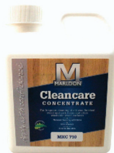
MARLDON MXC710 CLEANCARE CONCENTRATE

Wooden floors which may often become contaminated with grease, sweat or residue from other sources, may require additional cleaning to remove these materials.