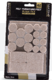
SECTINO™ FELT FURNITURE FEET